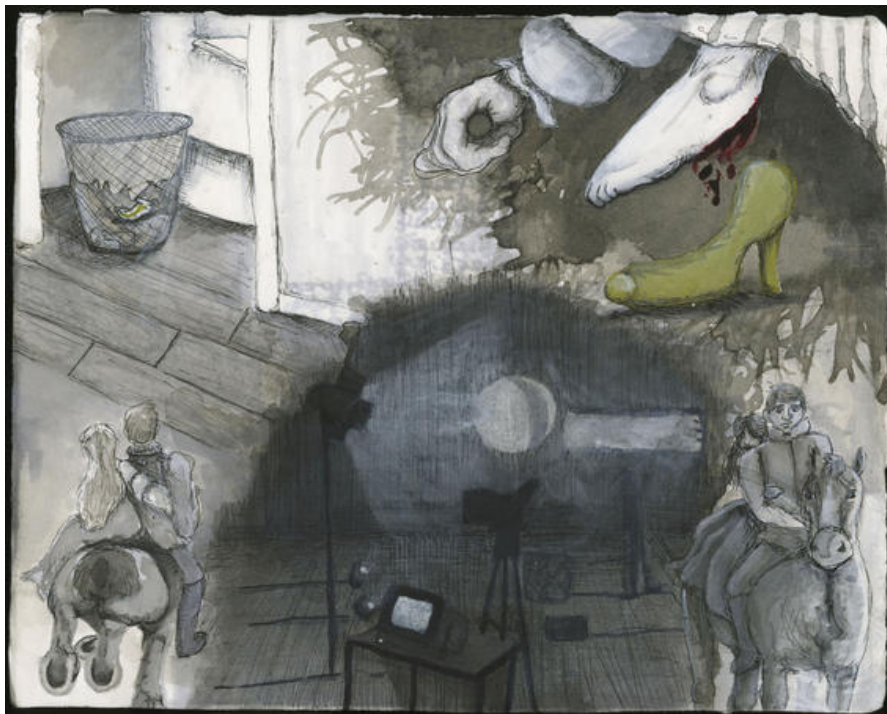
Monique Diaz's Cinderella 3 , on display at Diaspora Vibe.

In spite of the blistering mercury burning up thermostats and keeping all but the most dogged culture vultures cinched to the nearest air-conditioning unit, this Saturday night's Wynwood gallery crawl promises a lineup of shows and events that will give you plenty to pant about, not to mention ubiquitous complimentary cocktails to cool you.