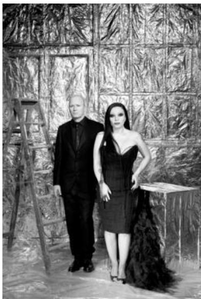
Fangoria performs this Saturday at Awarehouse.