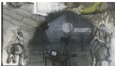
Monique Diaz's Cinderalla 3 , on display at Diaspora Vibe.

World Class Boxing is also showcasing "Mystic Visage," a compelling group show that explores the mask as an object used to both disguise and protect, empowering the user to articulate the most veiled thoughts more freely while imbuing rituals with mystery and power. Culled from the Scholl Collection and curated by Desiree Cronk , the exhibit includes sculpture, drawings, and photography and boasts names such as Cindy Sherman , Gabriel Orozco , Fergus Greer , and Jack